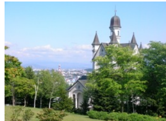
Snow Crystal Museum

Northern arts and crafts complex. Take bus 53 from Asahikawa Station to Takasagodai Iriguchi. 9:00 - 17:00 / 1200 yen (3 museums)