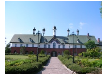
Yukaraori Folk Craft Museum