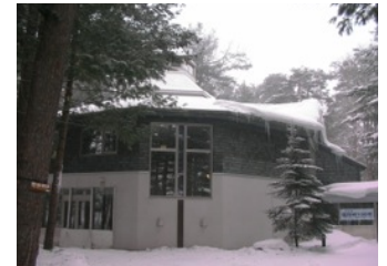
Miura Ayako Literature Museum