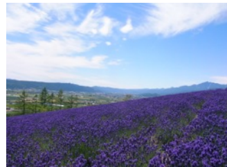
Lavender garden on the hill