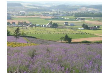
Lavender and rural area