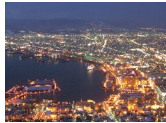
Spectacular night view

10:00 - 22:00, to 21:00 (16 Oct to 24 Apr) / 1200 yen