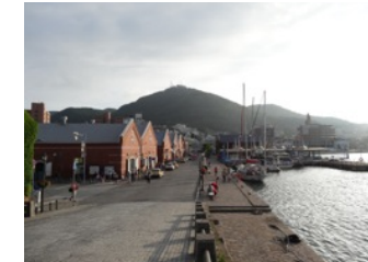
Warehouses and Mt. Hakodate