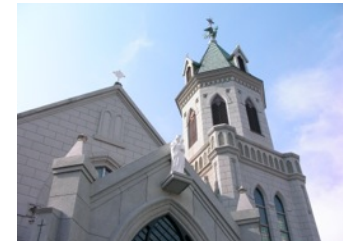
Catholic Motomachi Church