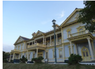
Facing Motomachi Park

9:00 - 19:00, to 17:00 Nov - Mar / 300 yen