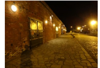
Walk across the street at night