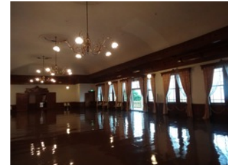
An elegant hall