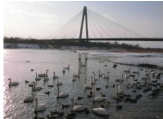
Tokachi River & Aqua Park

This spa town is facing Tokachi River, 30 minutes from Obihiro Station by bus. Soak in a plant-derived hot spring. 13:00 - 22:00 day trip bath (Fuji Hotel) / 500 yen