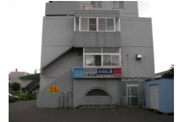
Tanukinosato (12:00 - 24:00)