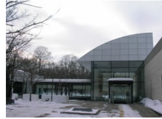
Obihiro Museum of Art