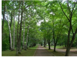
Road of the sculpture

Vast green oasis is spreading in city center, there was a Tokachi Prison from 1895 to 1976. Hike across the cultural forest. Good museums, zoo and wildflower garden in this park. 17 minutes on foot from Obihiro Station south gate.