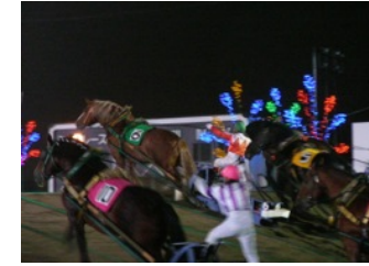
Ban'ei horse racing

Traditional horse sledding races (Ban'ei Keiba) are being held on weekends. Summer racing start from 14:30 to 20:35 (about every 30 minutes). 20 minutes on foot from Obihiro Station. Entrance fee (season ticket) is 100 yen.