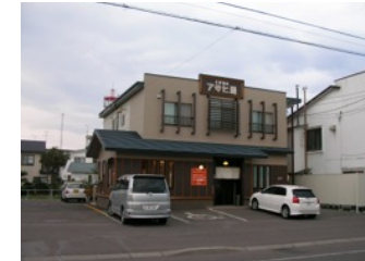
Asahiya (13:00 - 23:00)

About 10 minutes on foot from Obihiro Station, getting into local hot springs. Asahiya closed 2nd & 4th Thu except holiday.